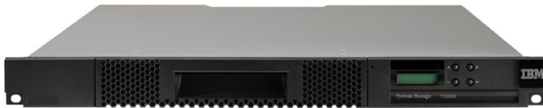
Figure 1. TS2900 Tape Autoloader

The TS2900 Tape Autoloader is shown in the following figure.